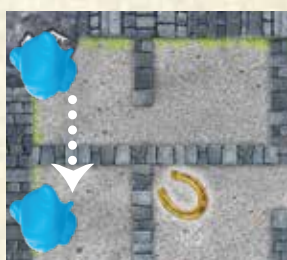
Front of maze board A: Red gnome pulls blue gnome with him through a wall on this side.

The maze paths are different on each side of the board. You may move your mover only along the paths on your side of the board. You cannot move your mover through a wall in the maze – but the player on the other side of the board CAN move your mover through walls. That's how you help each other reach a treasure!