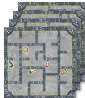
4 game boards