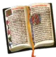
Ancient Book Holds all the world's knowledge.