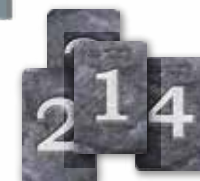
4 corner start cards