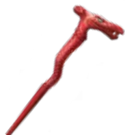
Walking Stick Leads any lost traveler home again.