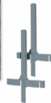
2 plastic posts