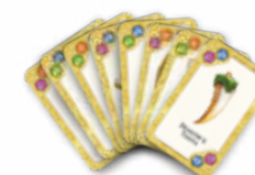
12 treasure cards