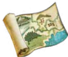
Map of Legends Reveals the hidden lairs of mythical creatures.