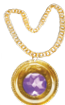
Amulet Glow when its wearer is lied to.