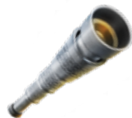
Spyglass Reveals the future.