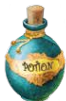
Magic Potion Turns metal into gold.