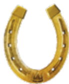
Golden Horseshoe Wards off misfortune.